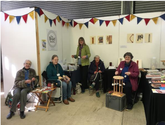
The team and stand at Wonderwool Wales

The Braid Society had a stand at Wonderwool Wales at the Royal Welsh Showground in Builth Wells, Wales this year. This is the third year we have taken the Braid Society Travelling Show and stand to this two-day event and each year the event seems to get bigger and better.