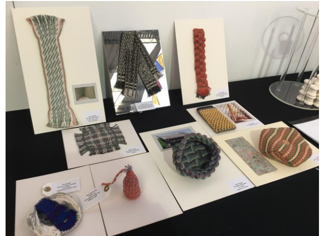
Some of the Travelling Show exhibits

Pictures of all this year's Travelling Show exhibits will be in Strands 2024 later in the year.